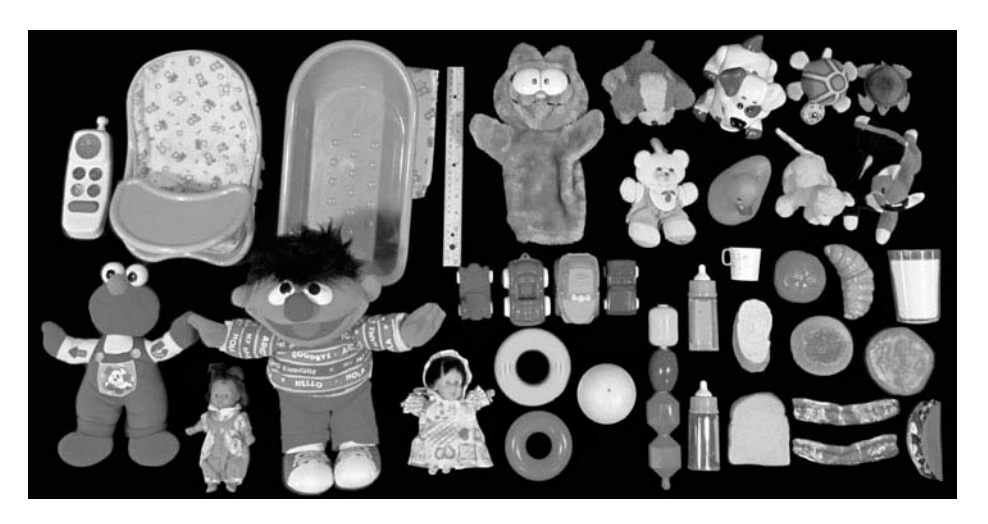
FIGURE 1 Toy objects presented by the Spanish-speaking tutors (with ruler included to show size).

gaze shift was calculated for each infant for each session, and averaged across the two sessions for the "gaze-shift proportion." A "face-only proportion," "toy-only proportion," and "look-away proportion" were similarly calculated. Rater agreement was determined by having an independent coder rate one session for each infant. The inter-rater agreement for infants' gaze behavior was excellent (Cohen's kappa = .81).