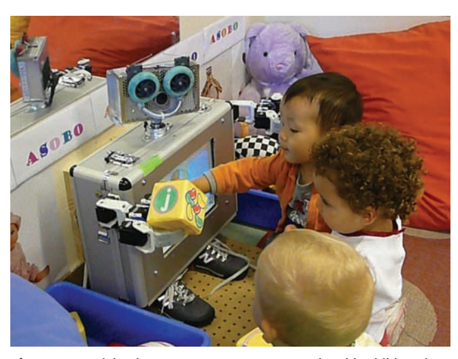
Fig. 4. A social robot can operate autonomously with children in a preschool setting. In this photo, toddlers play a game with the robot. One long-term goal is to engineer systems that test whether young children can learn a foreign language through interactions with a talking robot.

The science of learning has also affected the design of interventions with children with disabilities. Speech perception requires the ability to perceive changes in the speech signal on the time scale of milliseconds, and neural mechanisms for plasticity in the developing brain are tuned to these signals. Behavioral and brain imaging experiments suggest that children with dyslexia have difficulties processing rapid auditory signals; computer programs that train the neural systems responsible for such processing are helping children with dyslexia improve language and literacy (76). The temporal "stretching" of acoustic distinctions that these programs use is reminiscent of infantdirected speech ("motherese") spoken to infants in natural interaction (77). Children with autism spectrum disorders (ASD) have deficits in imitative learning and gaze following (78-80). This cuts them off from the rich socially mediated learning opportunities available to typically developing children, with cascading developmental effects. Young children with ASD prefer an acoustically matched nonspeech signal over motherese, and the degree of preference predicts the degree of severity of their clinical autistic symptoms (81). Children