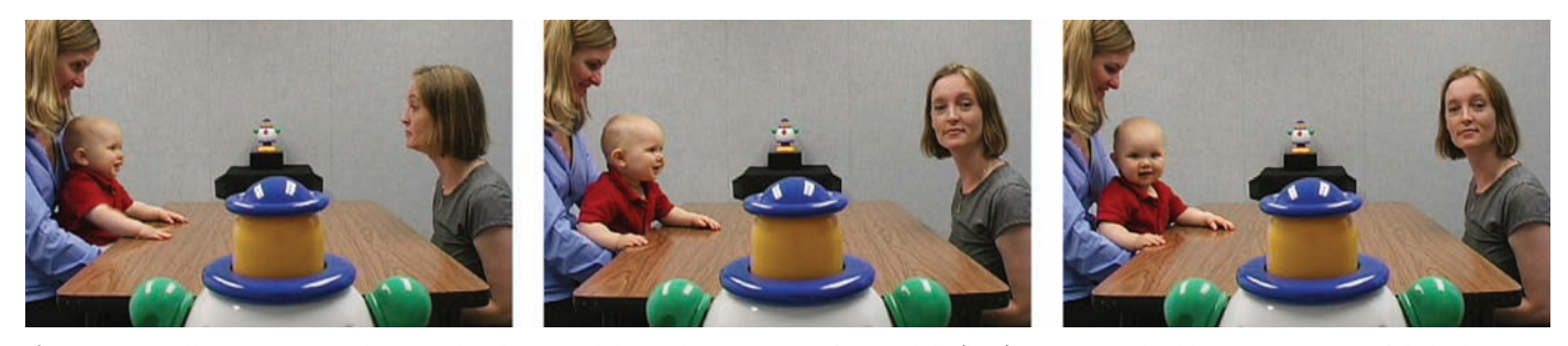
Fig. 2. Gaze following is a mechanism that brings adults and infants into perceptual contact with the same objects and events in the world, facilitating word learning and social communication. After interacting

Shared attention. Social learning is facilitated when people share attention. Shared attention to the same object or event provides a common ground for communication and teaching. An early component of shared attention is gaze following (Fig. 2). Infants in the first half year of life look more often in the direction of an adult's head turn when peripheral targets are in the visual field (31). By 9 months of age, infants interacting with a responsive robot follow its head movements, and the timing and contingencies, not just the visual appearance of the robot, appear to be key (32). It is unclear, however, whether young infants are trying to look at what another is seeing or are simply tracking head movements. By 12 months, sensitivity to the direction and state of the eyes exists, not just sensitivity to the direction of head turning. If a person with eyes open turns to one of